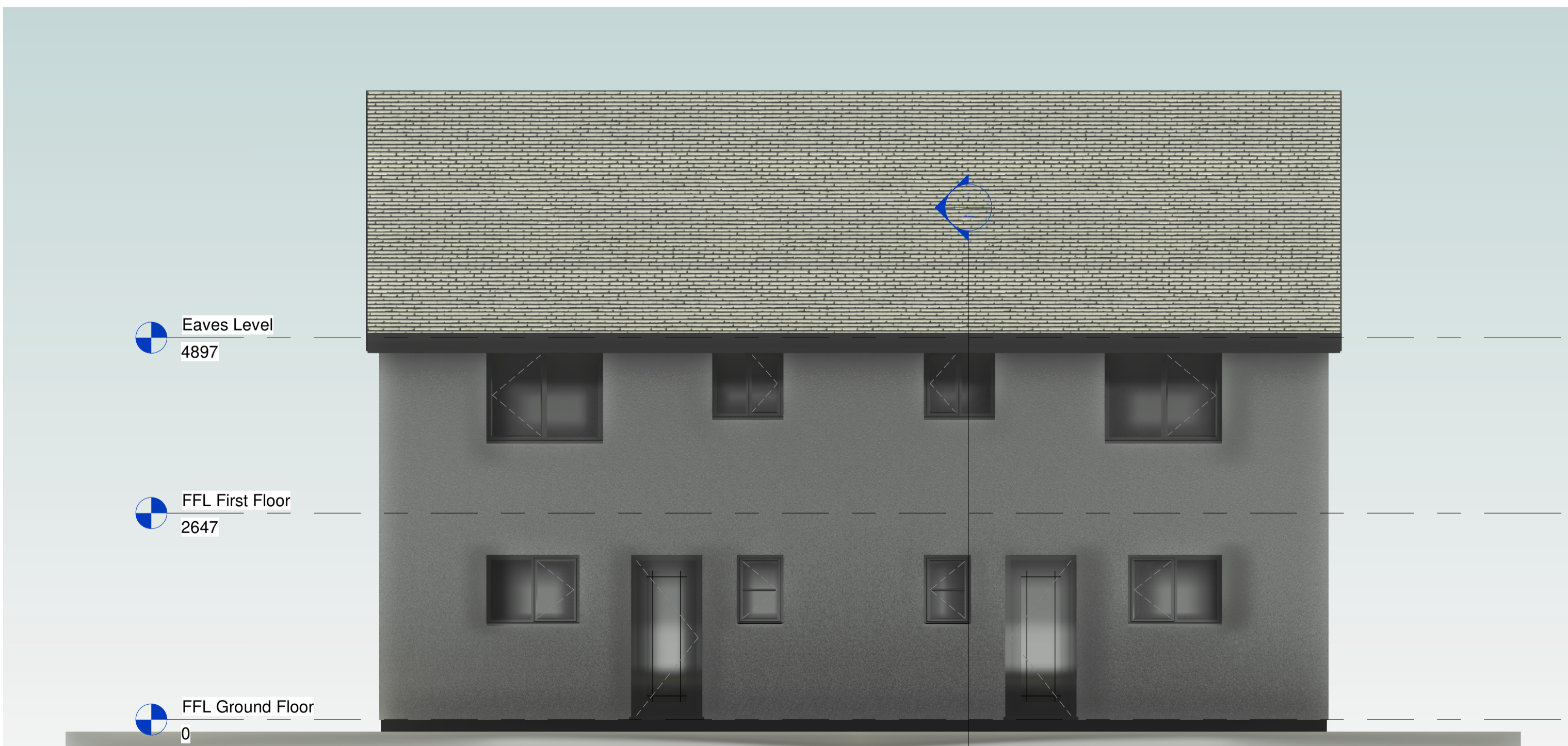
2 Rear Elevation 1 : 50