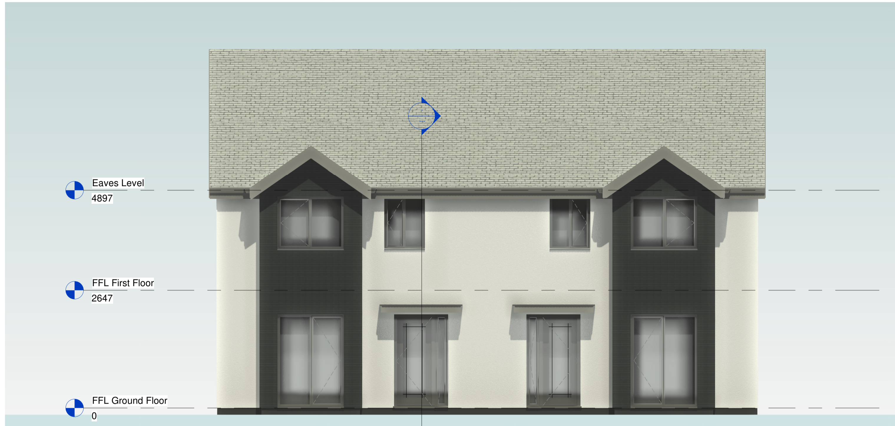
3 Front Elevation 1 : 50

PROPOSED MATERIALS: WALLS: ROUGHCAST WEBER SELF-COLOURED RENDER IN PEARL GREY WITH MARLEY ETERNIT CEDRAL CLICK CLADDING IN SLATE GREY WHERE SHOWN ROOF: NATURAL SLATE ROOF WINDOWS & DOORS: uPVC in ANTHRACITE GREY GUTTERING & FASCIAS: uPVC (COLOUR TBC)